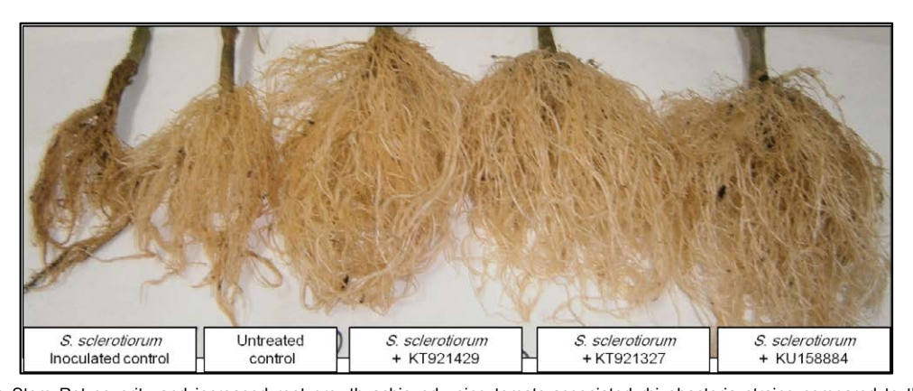
Figure 3: Sclerotinia Stem Rot severity and increased root growth achieved using tomato-associated rhizobacteria strains compared to the untreated and S. sclerotiorum -inoculated control. KU158884: Bacillus thuringiensis B2; KT921327: B. subtilis B10; KT921429: Enterobacter cloacae B16.

using these tomato-associated rhizobacterial strains where stem rot severity was reduced by 86-100% compared to S. sclerotiorum -inoculated and untreated control (Table 3 and Figure 3).